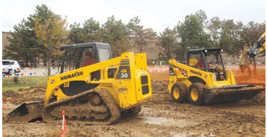
Following heavy rains, Komatsu product managers demonstrated the benefits of Komatsu's skid steer and compact track loaders by moving dirt in the display area.