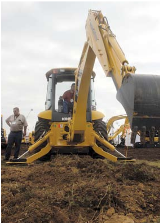
One of the benefits of ICUEE is the opportunity for attendees to demonstrate equipment, such as Komatsu's WB146-5 backhoe loader. Also available at the show was the WB146PS-5, which features power shift.