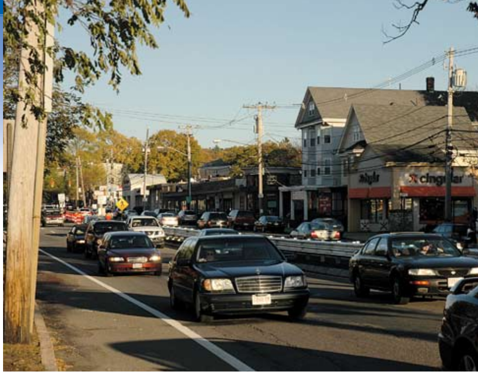
Clean streets are a source of pride for residents of Brookline, Mass.