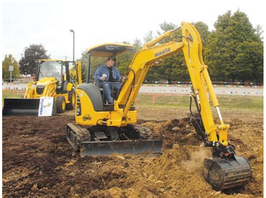
ICUEE attendees had the chance to try the latest in utility equipment, including Komatsu's PC35MR-2 excavator.

Accomplishing more in less time is also an advantage of the ICUEE show. "This show allows users to see a large number of machines in a short time without going from dealership to dealership and taking a lot of valuable time to test equipment," said Facchinei. "We're here to help them see how Komatsu stands out from the competition and what we have to offer in terms of productive equipment and the service and support to back it up." ■