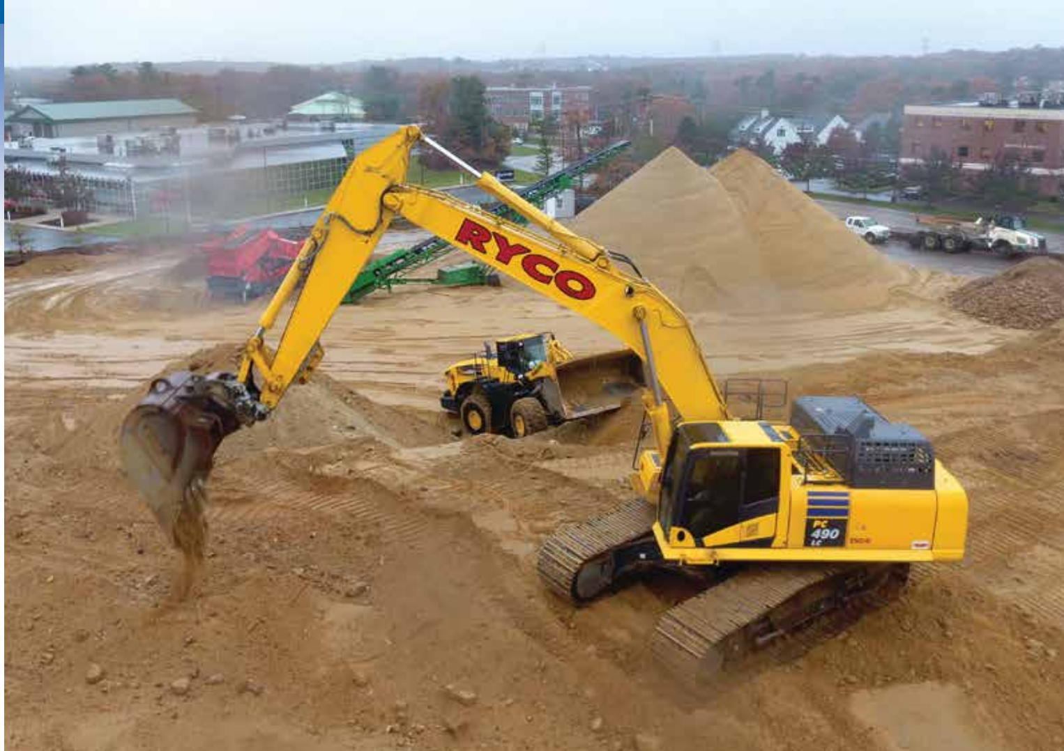
A crew from Ryco Excavating Contractor, Inc. removes overburden from a jobsite in Plymouth, Mass., using a Komatsu PC490LC excavator paired with a WA500 wheel loader.